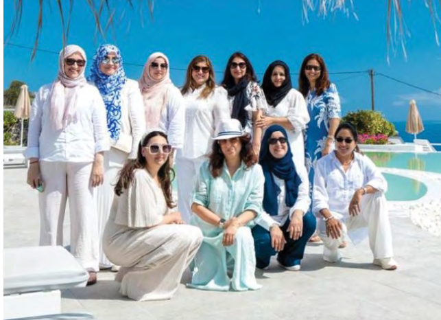
Literacy Ladies Book Club in protective shades.

Everyone was seen wearing UV protection sunglasses and many with a sun hat. It's a climate that poses a high risk to sun-related eye health, and so Santorini hospital is fully equipped with a surgical ophthalmology department as well as assisting eyecare professionals at the private polyclinic. Speaking to locals, they said lubricating eye drops were common for Santorini pink eye, dry eyes from dust and Santorini vine polyphenols, which can damage eye surface tissues if left untreated. Milan said sunlight coming