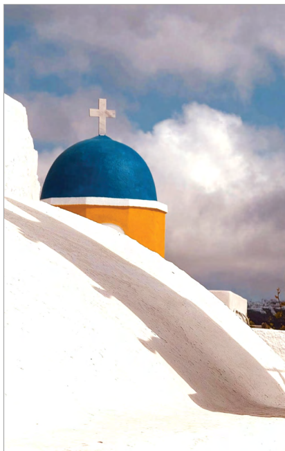
Peak of Santorini.