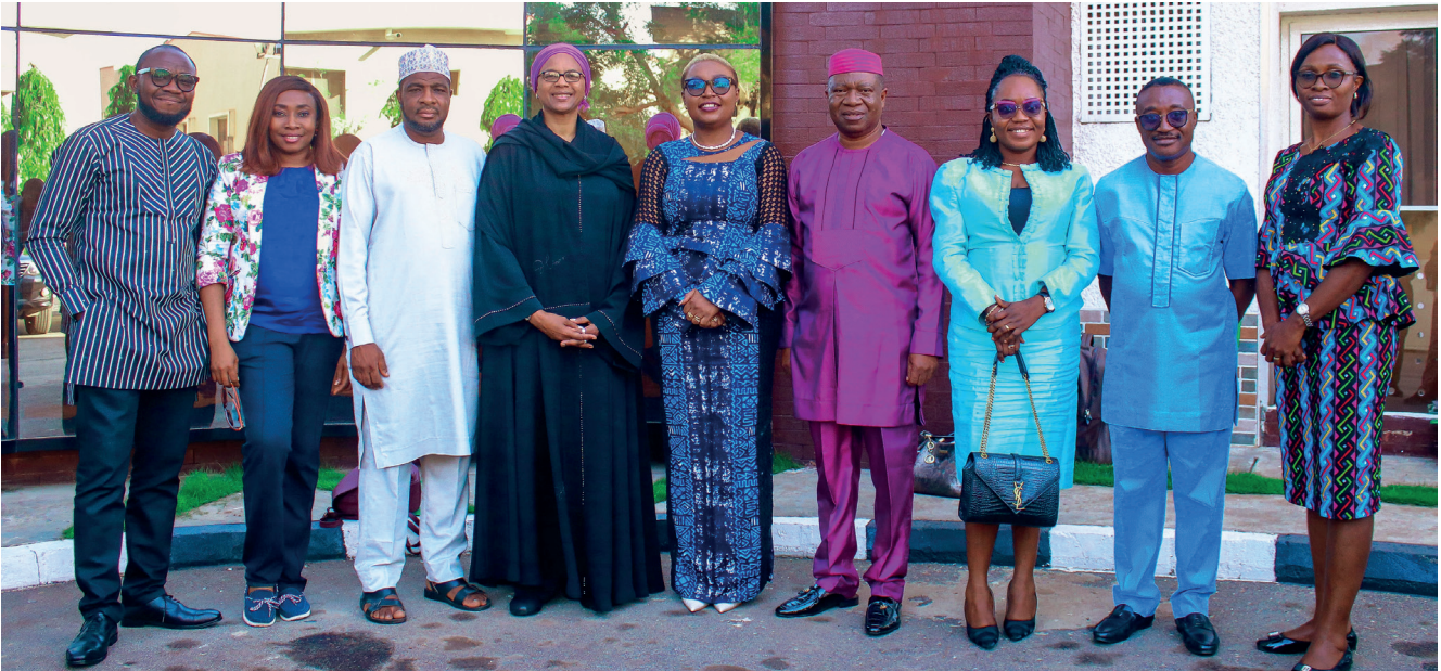
Participants of the Glaucoma Toolkit and Guidelines Workshop.