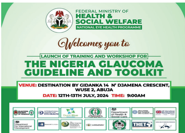
Glaucoma Toolkit launch in Nigeria.

In the first day of the exercise, participants were trained on diagnostics, staging and risk assessment of glaucoma with reference to checklist proformas 1, 2 and 3. These forms are detailed and comprehensive, meant for both newly diagnosed and returning patients. The decision algorithms for different types of glaucoma were also discussed including management of glaucoma with co-existing common eye diseases like cataract. The second day was kick-started with a recap of the first day's events and was followed by other exciting topics, like: