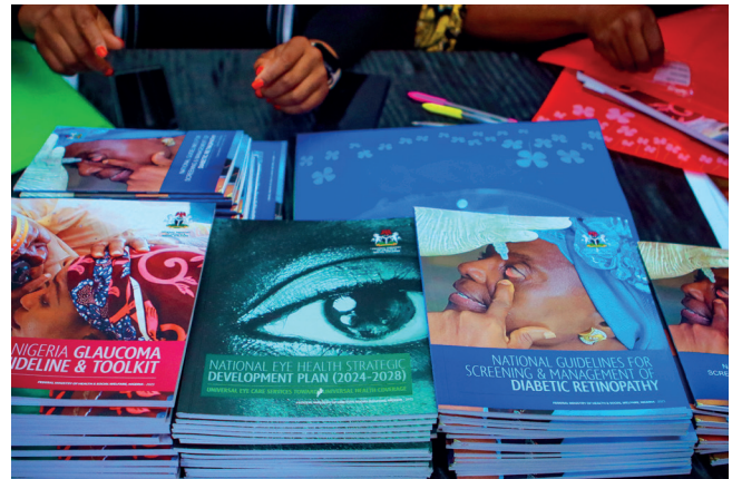
Federal Ministry of Health document; The Nigeria Glaucoma Guideline & Toolkit used for this training in July 2024.