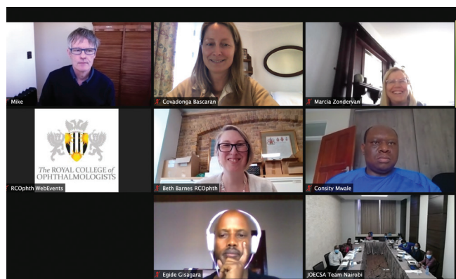
Zoom participants at the JOECSA-Eye Workshop held in Nairobi, March 2021.

The JOECSA-Eye project, part of the long-standing VISION 2020 LINK between the RCOphth and COECSA, has provided timely training and mentorship for the new editorial board of JOECSA . The board of JOECSA has successfully implemented the new online system for submission and review of papers and continues to work towards increasing the submission rates for the journal.