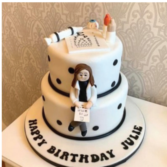
A birthday gift made for a colleague.